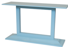
3005 Sofa/Console Table 48L 15W 32H