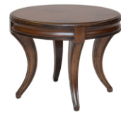
1226 Round Spot Table 21Dia. 18H