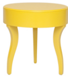
1206 Round Spot Table 14Dia. 16H