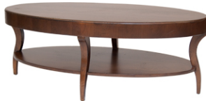
1201 Oval Cocktail Table 46L 26W 19H