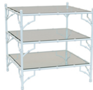
323 Rectangular End Table 26L 24W 29.5H