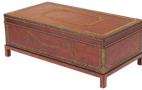
310 Trunk Cocktail Table 44L 24W 18H