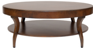
1200 Round Cocktail Table 42Dia. 19H