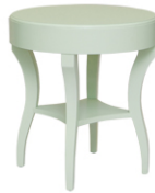
1207 Round Drink/Chairside Table 20Dia. 24H