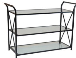
329 Console Table/Server 45.5L 18W 36.75H