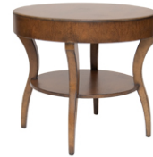
1204 Round End Table 27Dia. 27H