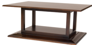
3000 Rectangular Cocktail Table 42L 30W 20H