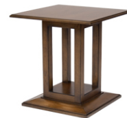
3007 Square Drink/Chairside Table 20Sq. 24H

We are pleased to provide the newest product introductions of The Superior Line for Summer 2011. All models are designed using different materials, well-balanced scaling, and functionality with a specific focus in mind: eclectic, and sophisticated occasional tables and accents covering a wide array of design choices. Materials ranging from Cherry wood species, to metal, to old aged leather, clearly define and differentiate these models from others in the marketplace. With multiple wood/metal finish options and plenty of storage, these new introductions create a new standard of classic appearance for the Superior line for years to come. Please enjoy our newest introductions by Superior!